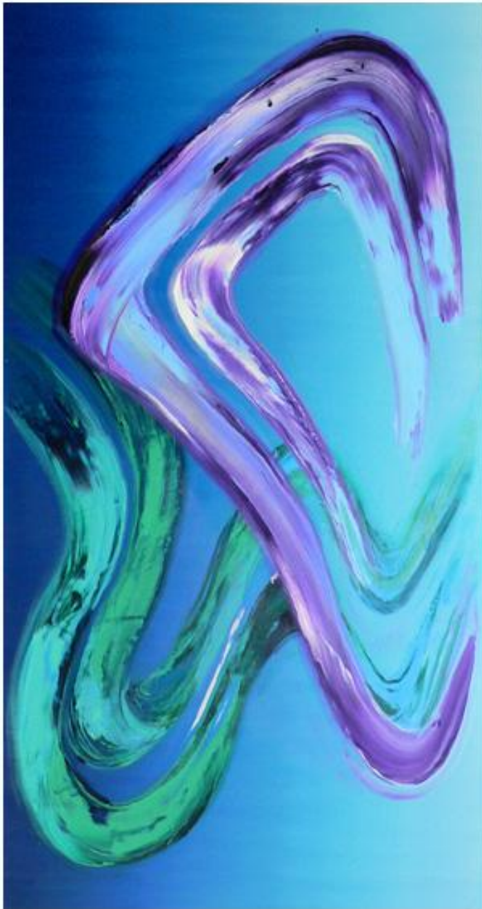
14 Weeks , Oil on Aluminium Composite Panel, 80cm x 40cm, £1,200