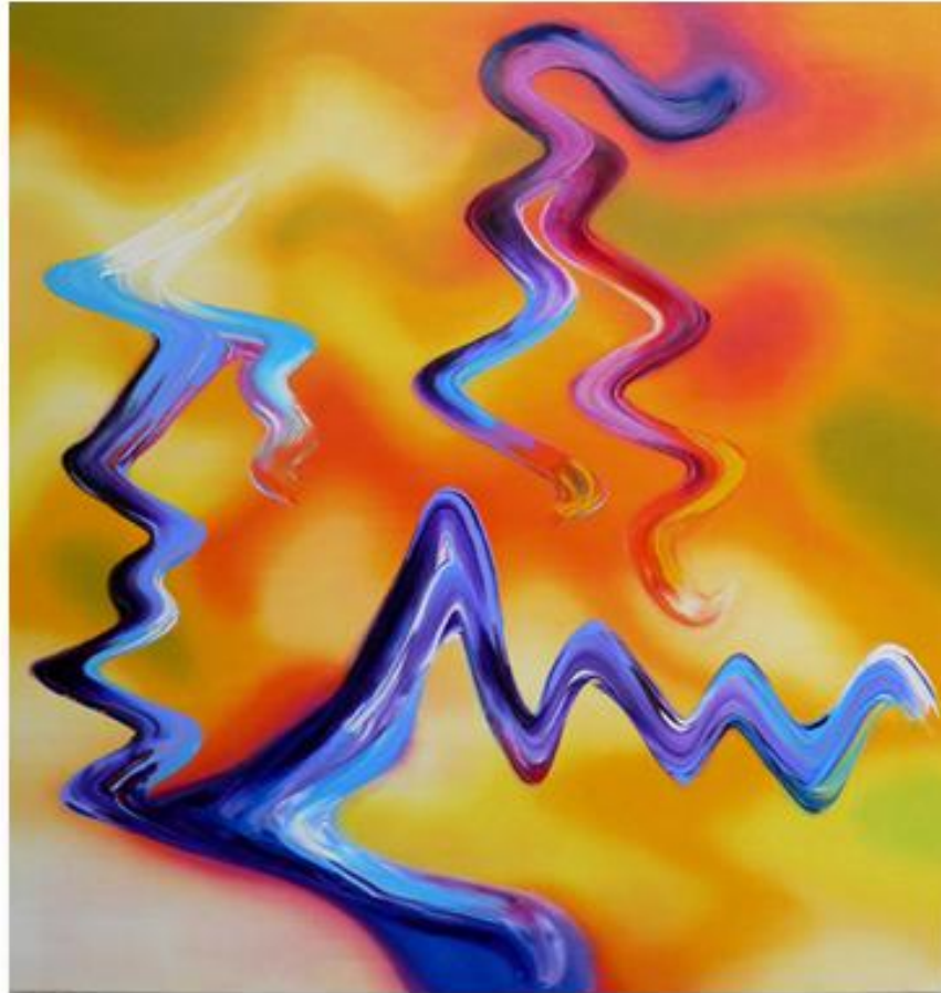
Arabian Night , Oil on Canvas 125 x 120cm £4,500