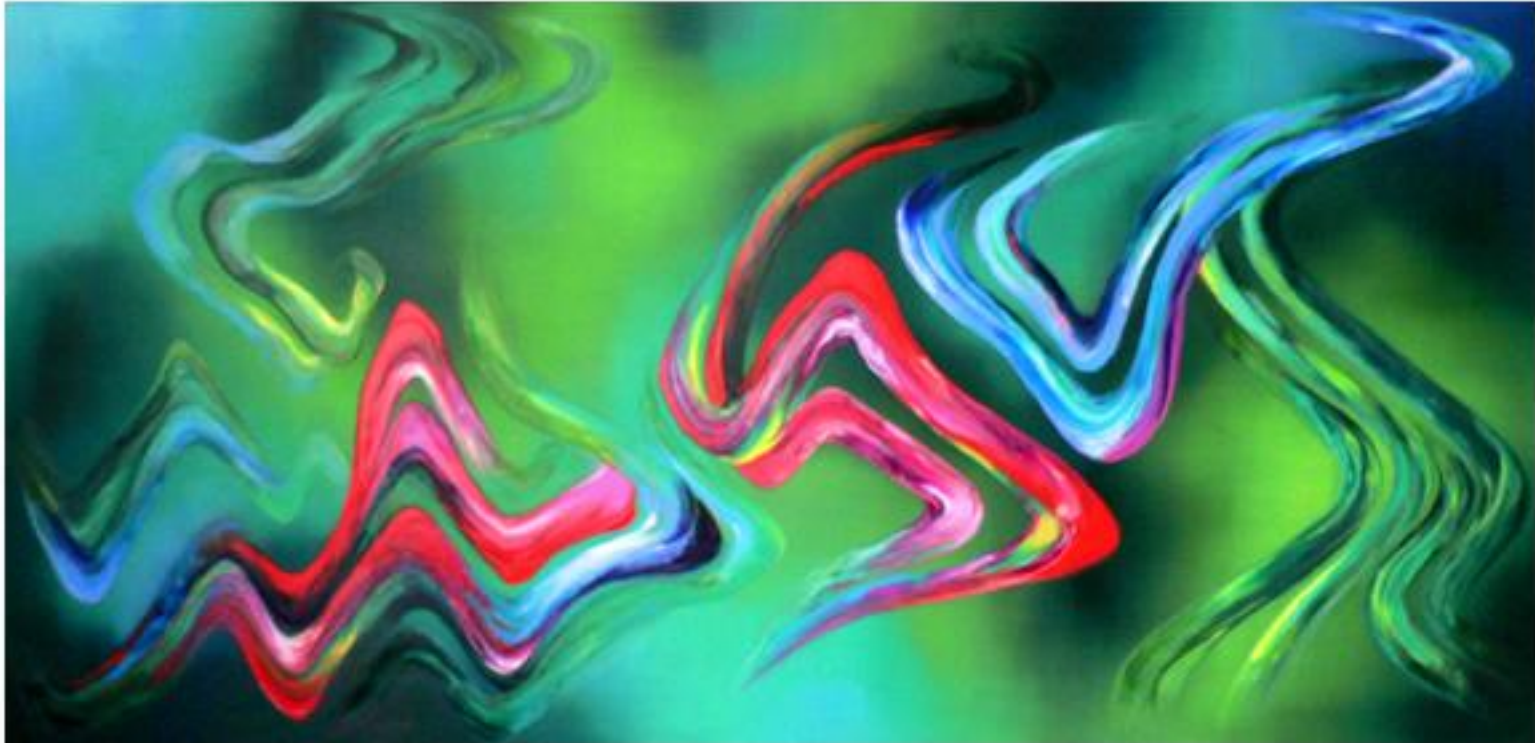
Fourteen Days , Oil on Canvas, 100cm x 210cm, £6,000