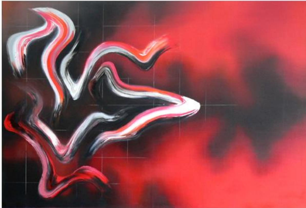
Red , 80cm x 120cm, Oil on Canvas, £4,500