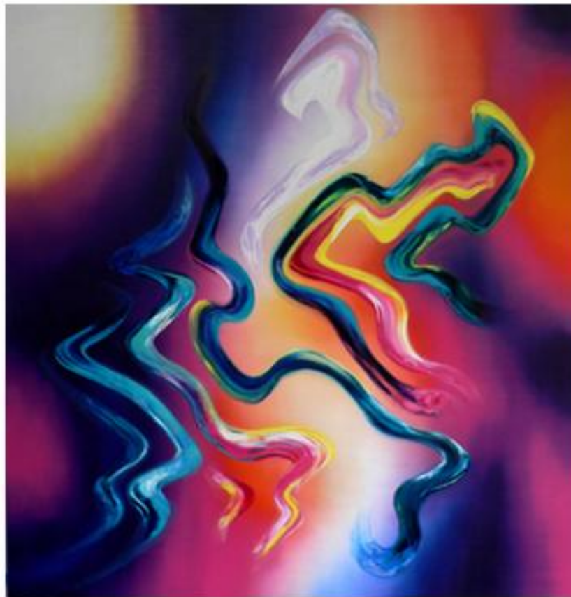
Valhalla , Oil on Canvas 125 x 120cm £4,500