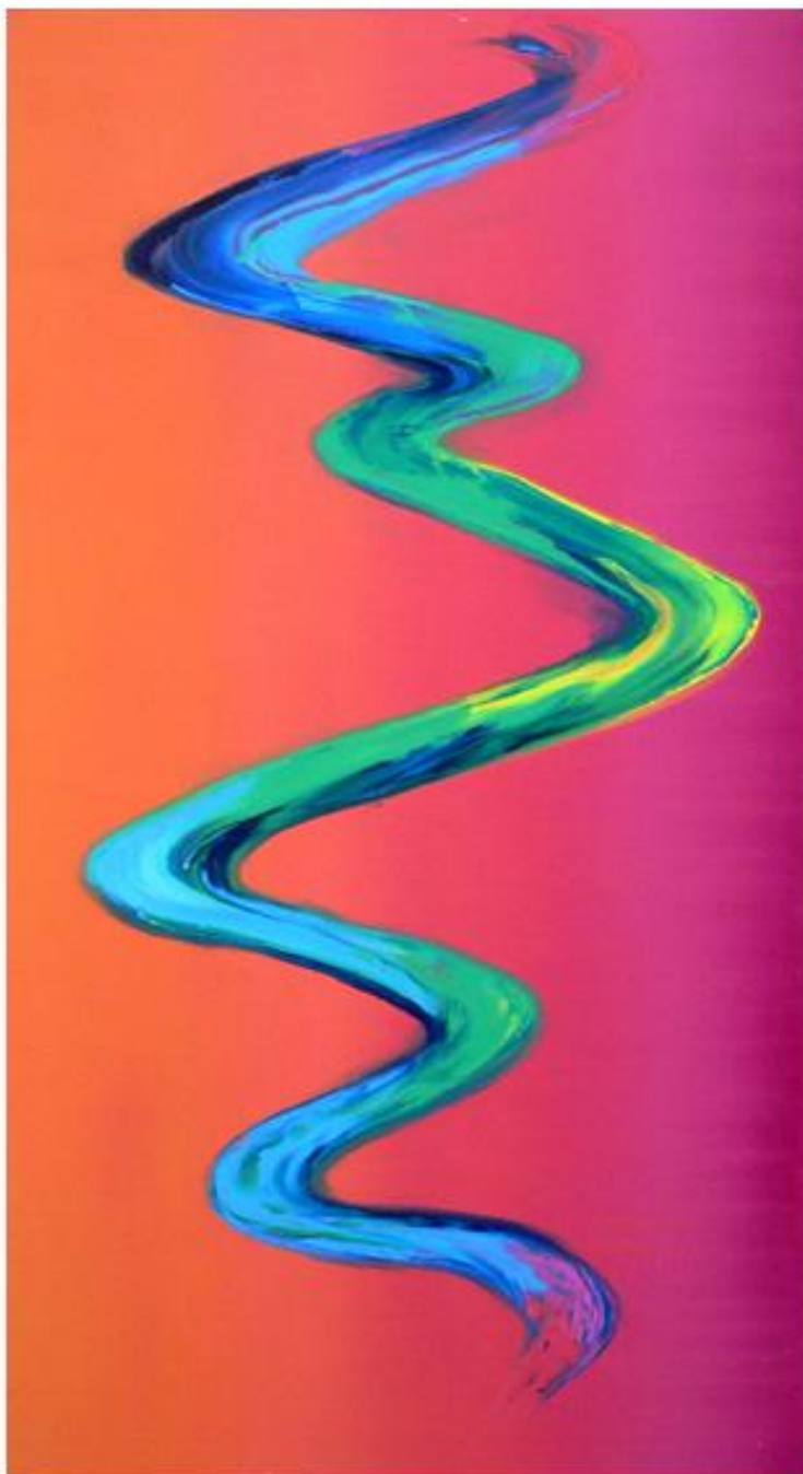
Into the Blue , Oil on Aluminium Composite Panel, 80cm x 40cm, £1,200