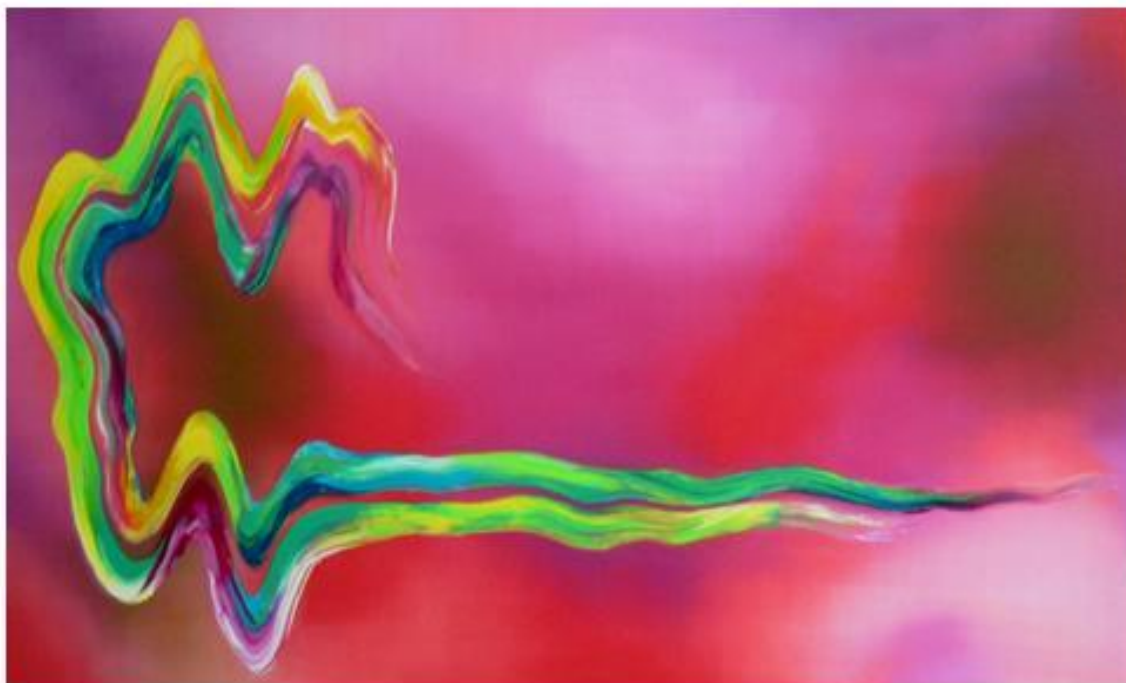
Circus , Oil on Canvas 90 x 150cm £4,500